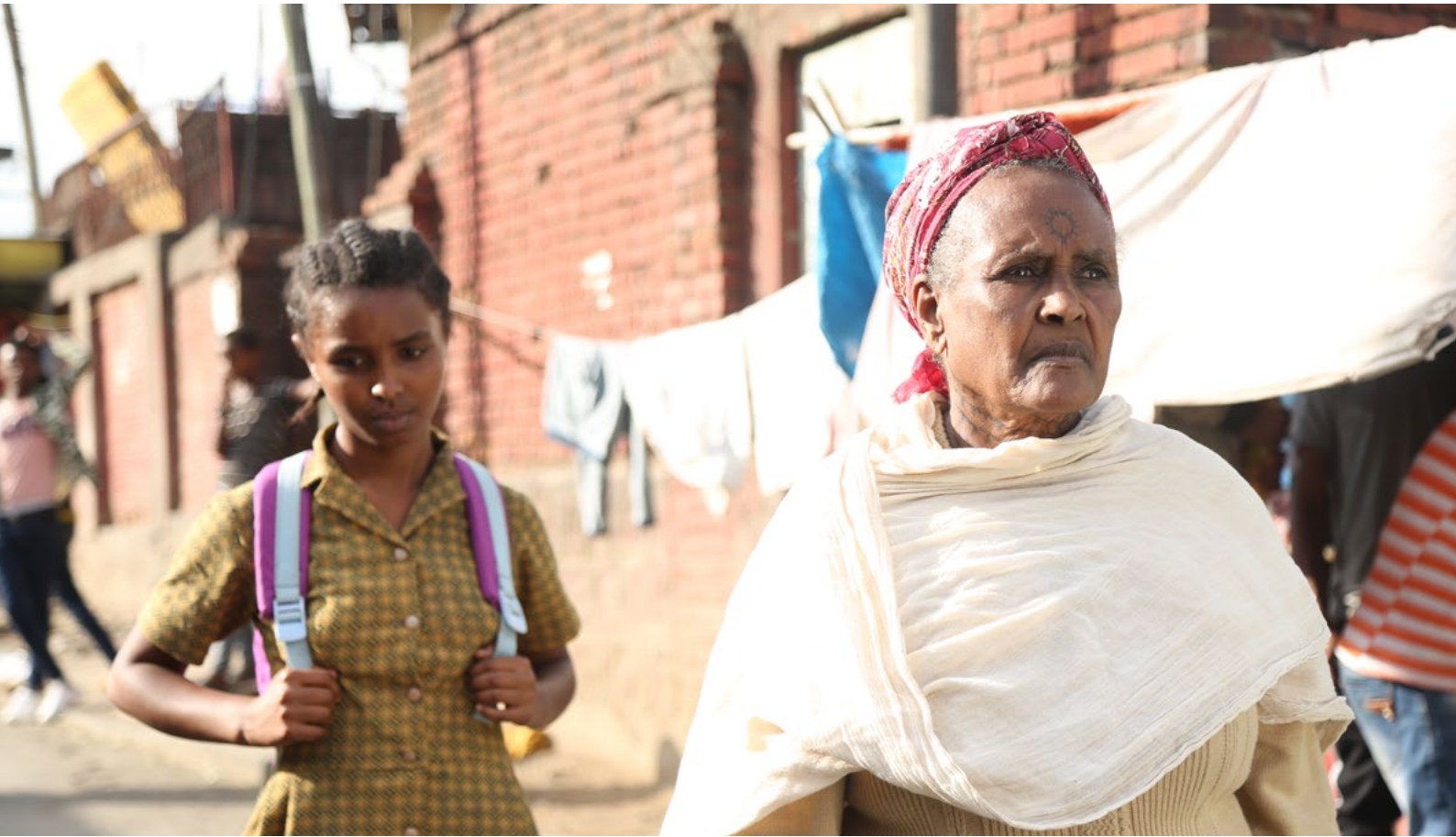
Fig Tree portrays the lives of two Shula families, Jewish and Christian whose complicated life circumstances tied their fate and established an inseparable relationship, based on warmth and solidarity.

I think of the people I had loved and left behind, the friends from “Shula” neighborhood that died while trying to have a life and the ones that became refugees, unable to find a place to settle safely and peacefully.